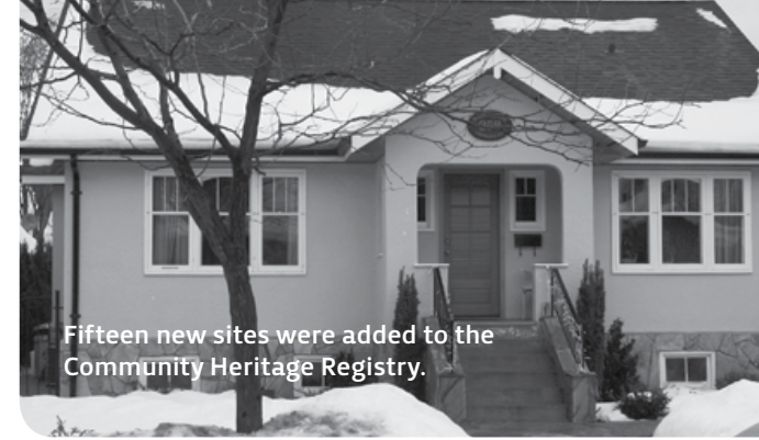
Fifteen new sites were added to the Community Heritage Registry.